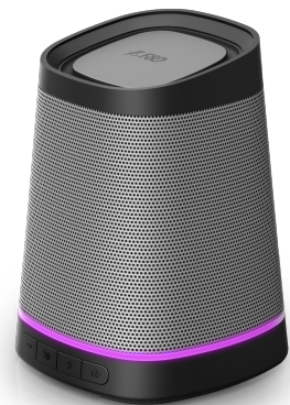
W7 User manual