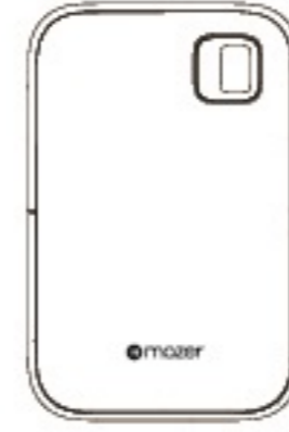
Magnetic wireless power bank ×1