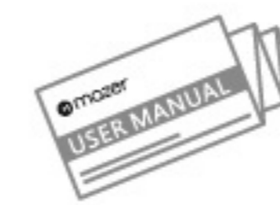
User manual ×1