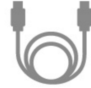
C-C Cable ×1